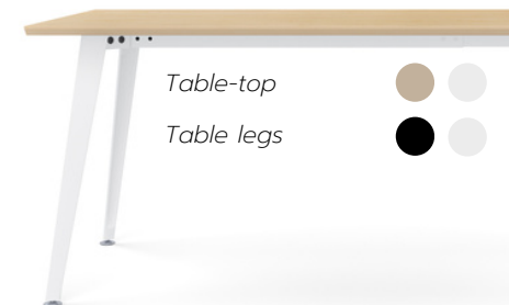
Height adjustable desk Elevate